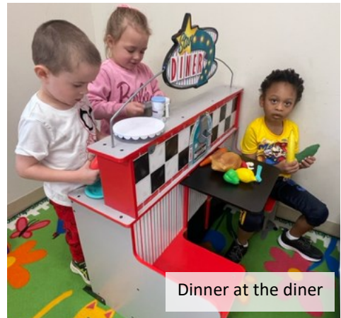
Dinner at the diner