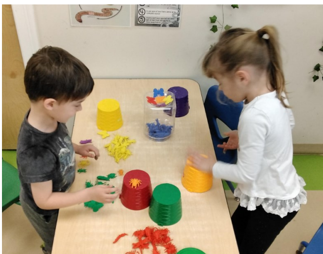
◀ Color and shape patterning with Insects (104)