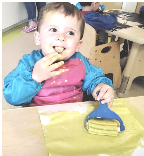
↑ Don't eat yellow...paint.